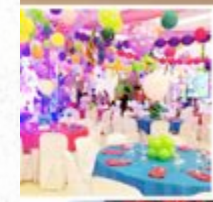
Creamery has been specializing in Kiddie Parties since 2007. Due to the special demand from our belowed customers, we launched our off-premise catering in February 9, 2013.